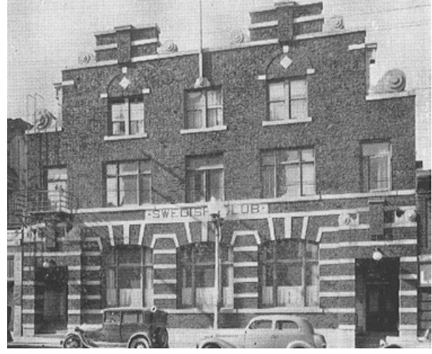
The Swedish Club's first building opened in downtown Seattle at Eighth Ave. and Olive St. in 1902.

The Club hosts a variety of educational and cultural events and celebrates traditional Swedish and American holidays. And especially don't forget to try their famous Swedish Pancakes breakfast: http://swedishclubnw.org/Events/pancake.htm