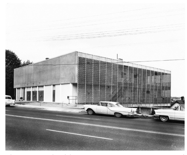
The current building on Dexter Avenue opened in 1961.

For a list of upcoming events at the Swedish Club, go to <a href="http://swedishclubnw.org/Events/regular.htm">http://swedishclubnw.org/Events/regular.htm</a>